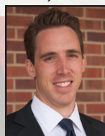
Joshua Hawley, J.D.